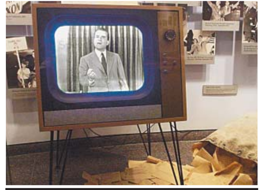
Top: the reflecting pool at the Nixon Library and Birthplace. Above: a '50s television playing the "Checkers" speech alongside some of the mail it spurred. Right: the dark corridor of the library's Watergate exhibit.